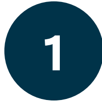
Figure 1: The Consolidation Process

The close process is initiated with a detailed calendar that sets target dates or each business unit to close their books and submit results to the corporate accounting group. It's common to see business units needing a week or more to close their books, which means that the corporate accounting group isn't able to start the consolidated close until a week or more after the period ending date.